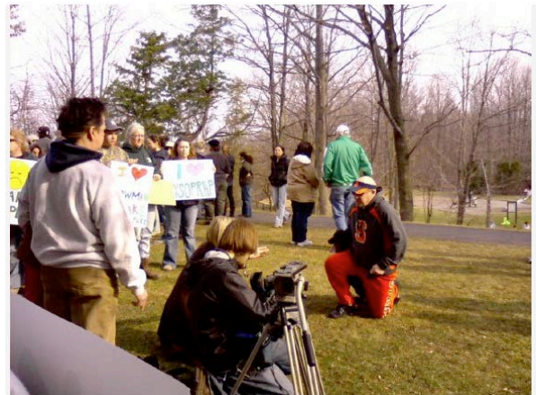
TV interview at the rally.

Several hundred people showed up, many carrying signs, to protest the planned closings. TV and newspaper coverage of the event drew wide and favorable attention.