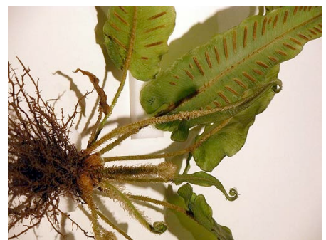
Asplenium scolopendrium var. americanum